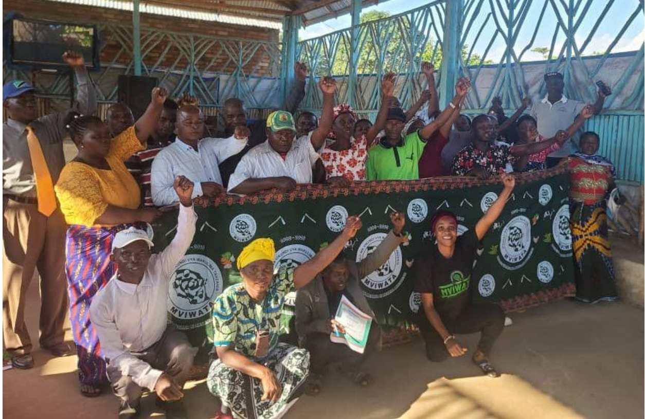
Leadership training as a process of strengthening MVIWATA across its networks underway in Shinyanga, Ruvuma and Njombe regions, organised and implemented by MVIWATA networks using internal built capacity.